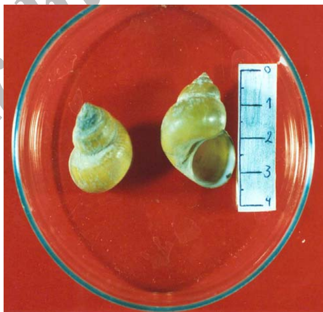
Fig. 1: Adult shell of Bellamya bengalensis snail in Khuzestan province.