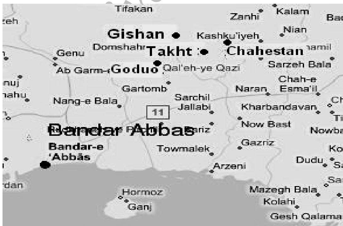
Fig. 1: The map of Bandar-abbas and the villages