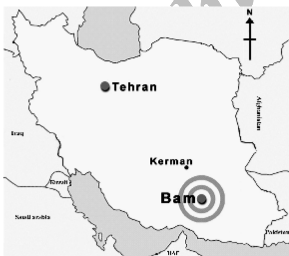
Fig. 1: Map of Iran showing location of Bam district, south-eastern Iran where the massive earthquake has occurred

city, where the person-to-person transmission is maintained by Phlebotomus sergenti (12-14). Approximately 85% of the CL cases are present in the city of Bam, while only 15% in small towns and in rural communities in the district (unpublished data). At present, ACL appears to be more prevalent than before and becoming a public health threat of considerable magnitude in Bam. ACL produces painless lesions of the skin, often healing to disfiguring scars. Some clinical forms of the ACL such as leishmaniasis recidivans may last many years and rarely responds to treatment, lead to a destructive and disfiguring lesion (15, 16). To the best of our knowledge, there are no published scientific paper regarding the impact of earthquake on the epidemiology of CL and most of the studies focused on the general health aspects and well-being of the survivors (17). Iran is prone to natural disasters such as earthquake. The city of Bam, the center of Bam district, is located along the Zagros Mountain range, 200 Km east of Kerman province in southeastern Iran. The population of the district consists 200000 including 100000 urban and 150000 rural. At 5: 45 a.m. on December 26, 2003, a devastating earthquake of 7.6 on the Richter scale struck the city of Bam and neighboring rural areas, southeast of Iran (Fig.1).