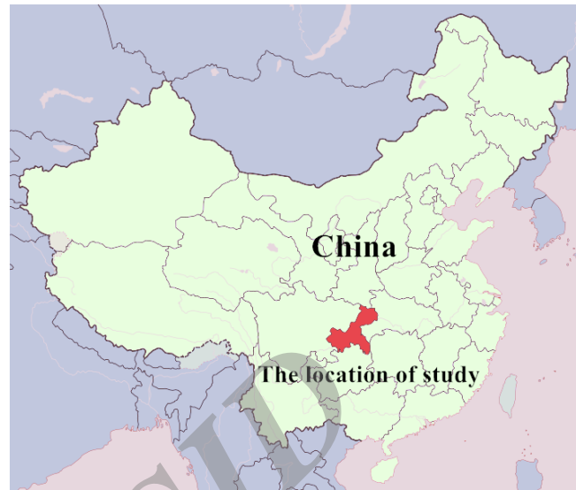
Fig. 1: The location of the program study on the Efficiency and effectiveness of the integrated health care services in Rural China

\chi^2 contingency table analyses showed that the ratios of respondents taking advantage of fasting blood glucose & blood pressure monitor were significantly different, with 41.09% and 25.33% of diabetics under 60 years old group and diabetics 60 years or older group respectively ( \chi^2=7.032 , P=0.008 ). More diabetics (42.17%) with income above the average income of rural residents in southwestern China reported the utilization of medication guide than diabetics with income below the average income (26.80%; \chi^2=7.230 , P=0.007 ). Utilization of urgent referral guide was different between diabetics with different needs of visit services. The percent of diabetics who needed visit services (27.41%) was significantly higher than diabetics who didn't need visit services (20.82%; \chi^2=5.426 , P=0.020 ). No respondent responded dorsalis pedis artery pulse check. The most likely reason is that primary care physicians had not realized the significance of this work.