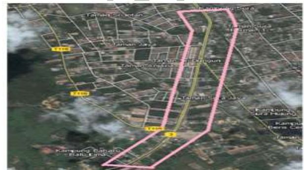
Fig. 1: The area of study

This study was done at residential areas along 3km stretch of Paka Road as shown in Fig. 1. Along this road, there are many residential areas, few schools, shop houses and also colleges.