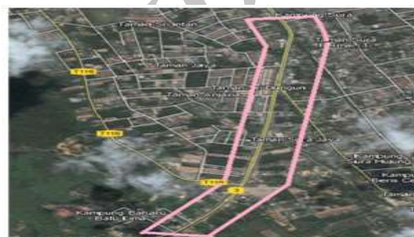
Fig. 1: The area of study

This study was done at residential areas along 3km stretch of Paka Road as shown in Fig. 1. Along this road, there are many residential areas, few schools, shop houses and also colleges.