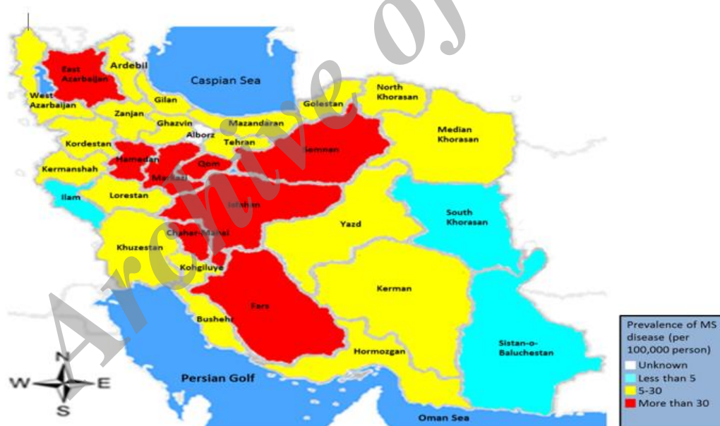
Fig.1: Prevalence of MS in Iran, 2006