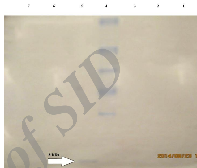
Fig. 3: The results of western blotting with positive human serum. Lines 1&7: NIH lysate without plasmid, lanes 2&6: NIH lysate containing plasmid without recombinant protein, lanes 3&5: NIH lysate containing recombinant pcHyd1. Lanes 1,2 and 3 after 48 h. Lines 5,6 and 7 after 72 h. Lane 4: protein molecular weight marker

Recombinant expression vector was transfected into NIH. NIH samples were lysed and the protein of HydI was analyzed by Western Blot (Fig. 3).