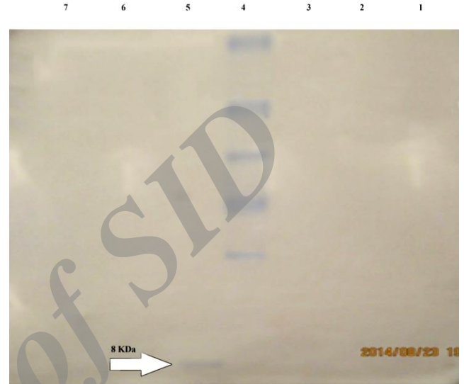
Fig. 3: The results of western blotting with positive human serum. Lines 1&7: NIH lysate without plasmid, lanes 2&6: NIH lysate containing plasmid without recombinant protein, lanes 3&5: NIH lysate containing recombinant pcHyd1. Lanes 1,2 and 3 after 48 h. Lines 5,6 and 7 after 72 h. Lane 4: protein molecular weight marker

Recombinant expression vector was transfected into NIH. NIH samples were lysed and the protein of HydI was analyzed by Western Blot (Fig. 3).