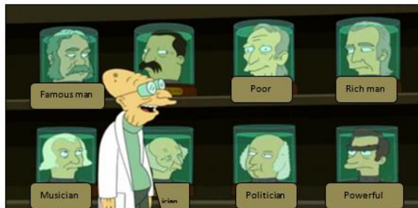
Fig. 2: Prioritize the head transplant (11)