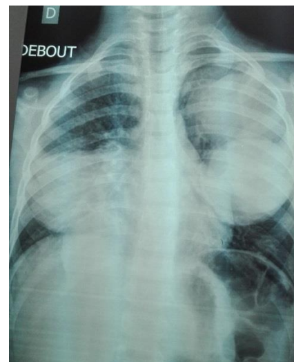
Fig. 1: Radiography shows multiple hydatid cysts of the lungs, one in the right side and two in the left side

There were 21 boys and 9 girls. The mean age of our patients was 8.12 \pm 2.5 yr. Twenty-eight (93.3%) patients were of rural origin. The symptoms at the time of presentation were coughing in 30% (n=9), hemoptysis in 20% (n= 6), and chest pain in 40% (n=12). The diagnosis was made incidentally on chest radiography in 10% (n=3). The average cyst diameter was 6.36 \pm 1.8 (3-10) cm. The cysts involved the left lung in 16 (63.6%) patients, the right in 11 (36.4%). Three (10%) patients had bilateral lung cysts (Fig. 1).