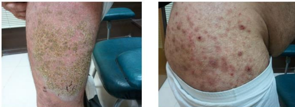
Fig. 2: Scabies lesions in a diabetes patient, in Ahvaz city, Southwest Iran, in 2015