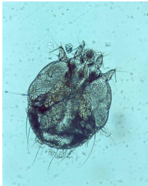
Fig. 4: Sarcoptes scabiei female isolated by scraping the skin, in Ahvaz city, Southwest Iran, in 2015