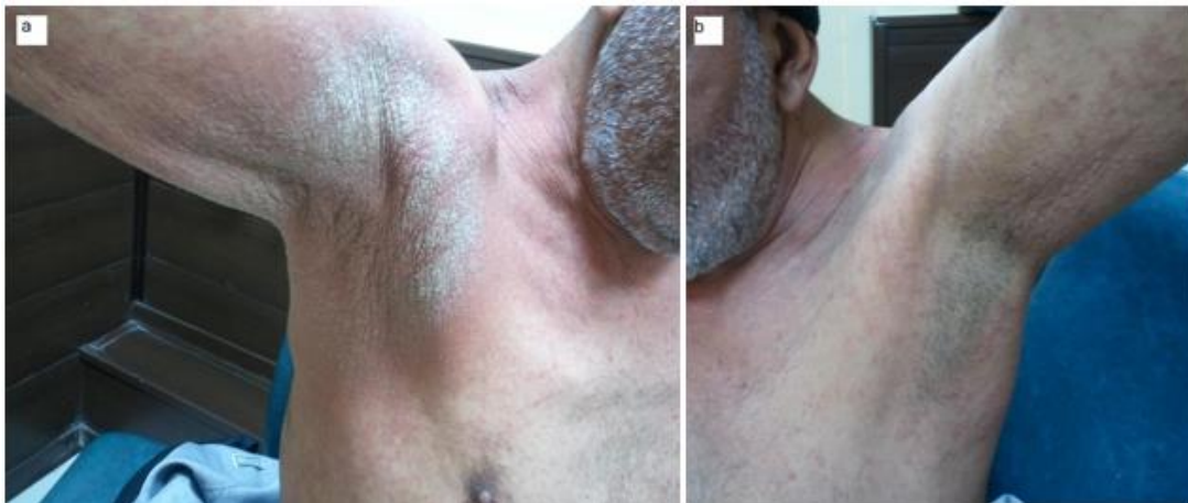
Fig. 1: Scabies lesions in immune- compromised patient, in Ahvaz city, Southwest Iran in 2015 (a: Right armpit, b: left armpit)

der with severe rash, hyperkratosis, and itching over his thigh, buttock and legs (Fig. 2). The patients were referred to Iran-Zamin Medical Diagnostic Laboratory, Ahvaz, Southwest Iran in 2015 for fungal examination. Scraping was performed from lesions of the skin and pathologic slide was prepared with 20% KOH. In microscopic examination presented huge infestation of S. scabiei in all forms of parasite included adult female, nymph stage and eggs (Figs. 3 and 4). The first patient's spouse was also infested by Sarcoptes in mild clinical signs. The disease was diagnosed as Norwegian scabies and the patients were successfully treated with topical ointment of 5% permethrin for two consecutive weeks.