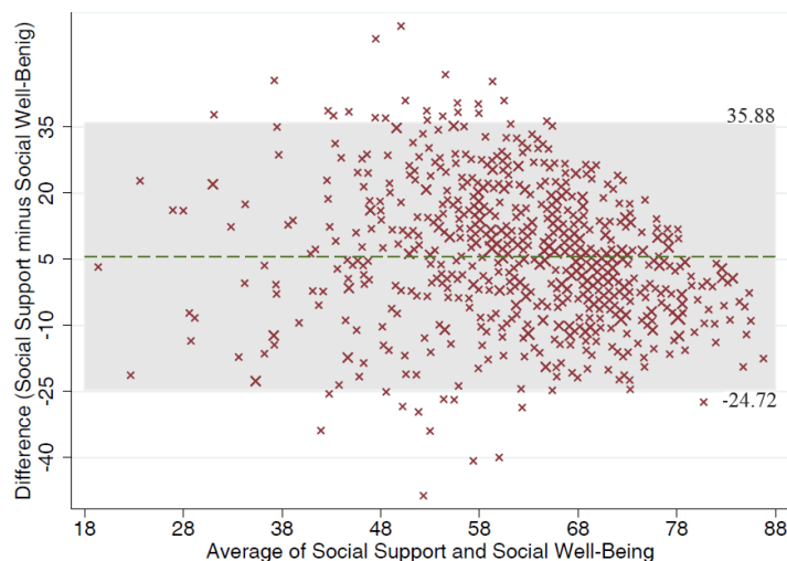
Fig. 2: The Bland-Altman agreement plot between social support and social well-being scales

** Correlation is significant at the 0.01 level (2-tailed). / / * Correlation is significant at the 0.05 level (2-tailed).