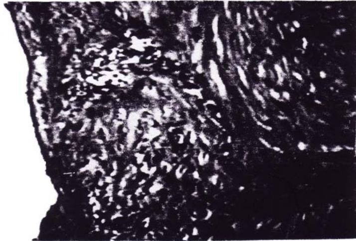
Fig. 1. Microscopic view of uterine inversion