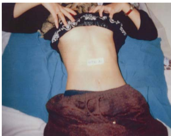
Fig. 3. Complete clearing of the pustular lesions after 10 days.