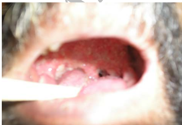
Fig 1. Oral and oropharyngeal tuberculosis.

In physical examination, multiple erythematous and irregularly ulcerative lesions affecting soft palate area, uvula and anterior tonsillar pillar was noted bilaterally (Fig 1).