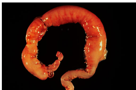
Figure 1. Patient with total colon Agangelionosis

Preoperative 5 pts had enterocolitis and 3 pts had ileus. The five reoperated pts were: one under one year, one 3, one 5 and two 7 years old. All these pts had the primary pull-through when they were younger than one year. primary procedures used in these last 5 cases were Rehbein (N=3), Duhamel (N=1) and laparoscopic Swenson (N=1). The 3 pts formerly operated by Rehbein technique presented with aganglionosis rectum 6 to 10 cm proximal to dentate line. The pt operated by Duhamel technique had a 7 cm aganglionic rectum pouch with colorectal anastomosis 3 cm proximal to dentate line. The laparoscopic pull-through (MTA- PT) was complicated by anastomosis fistula with pelvic abscess and totally stricture of the anastomosis. Also in this case was found an aganglionic distal segment 20 cm long.