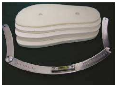
Figure 2. Blocks for iliac balance position

Injury to the lateral cutaneous nerve of thigh was seen in one patient that wasn't resolved during 1.5 year follow-up. Osteotomy was displaced in one patient. ultimately she gained 2.5 cm length. She is under follow-up.