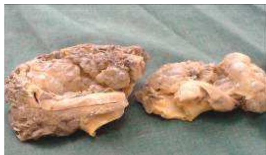
Figure 1. Gross pathology of pneumatosis intestinalis

Microscopic studies of small intestine showed multiple cysts situated in submucosa and serosal layer, being partially lined by a row of flattened cells, pink amorphous material, multinucleated giant cells, histiocytes and mixed inflammatory cells. Serosal layer was thickened, due to edema, neovascularization, infiltration of mixed inflammatory cells (especially around cystic structures), proliferation of fibroblasts and in some area fibrosis. Microscopic hemorrhage was seen in some foci of serosal layer.