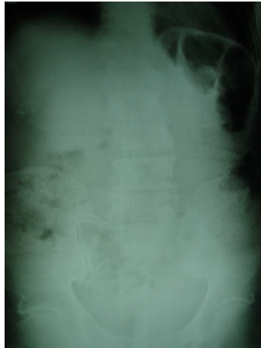
Figure 2. Supine plain abdominal image