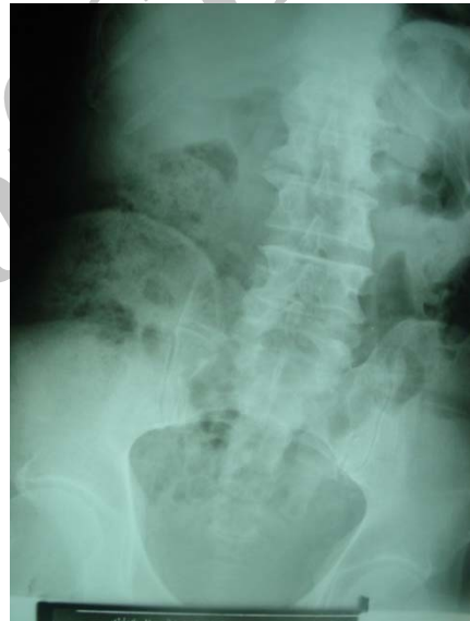
Figure 1. Upright plain abdominal image

The laboratory data showed a leukocytosis of 10,200 white blood cells per dl, LDH: 403 U/dl, Amylase: 58 U/dl and the arterial blood gas showed pH: 7.5, PO 2 : 54