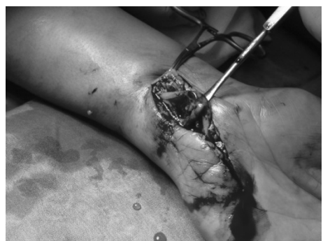
Figure 4. The ulnar nerve arch, after resection of the segment of FCU tendon

The entrapped anomalous arch of ulnar nerve in the FCU tendon was released by meticulous dissection and resection of a segment of the FCU tendon passing through the ulnar nerve arch (Figures 3, 4).