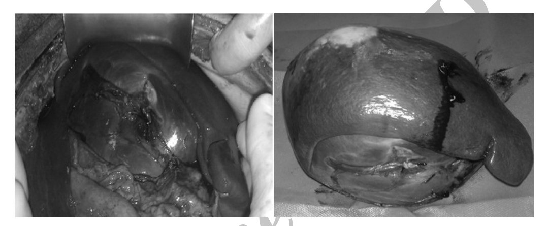
Figure 2. Intraoperative images of a huge splenic hydatid cyst (Case 1)

We decided to perform a splenectomy. The splenic vessels at the splenic hilum were controlled and after packing off the abdomen with hypertonic (20%) saline-soaked gauze to guard against spillage, we performed a splenectomy and then a cystostomy-capitonage to the cyst in the left lateral segment of the liver. Histopathologic examination confirmed the disease. In the postoperative period, the patient's condition was good, and no complications were observed. She was discharged with albendazole treatment.