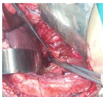
Figure 3. Hydatid cyst communicating with bile duct