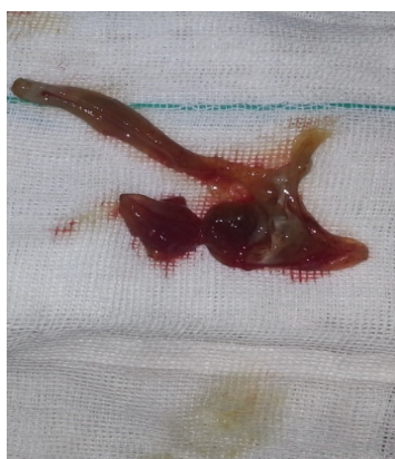
Figure 5. Daughter cyst and debris