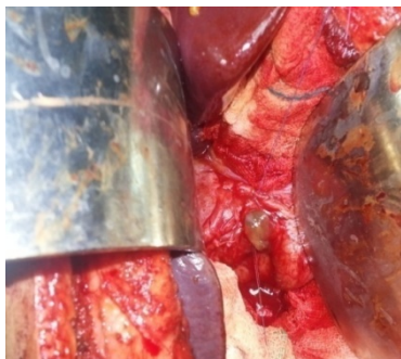
Figure 4. Daughter cyst in CBD