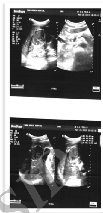
Figure 1. Ultrasound images showed liver hydatid cyst and dilated CBD.

cyst blocking the CBD. About 5 days after initial therapy, surgical intervention was performed. Surgical exploration showed a 5*5 cm hydatid cyst in a fifth and sixth segment of liver and dilated CBD. At first cholecystectomy was performed and hydatid cyst unroofed. There was a communicating fistula between cyst and intrahepatic duct at the base of the cyst that it was closed with suturing (Figure 3). Choledochotomy was performed, and daughter cyst and debris was extracted (Figure 4,5). Intraoperative cholangiography (IOC) revealed stenosis of Oddi then choledochoduodenostomy was performed. After surgical intervention, the patient was free of symptoms with only slightly increased cholestasis enzymes.