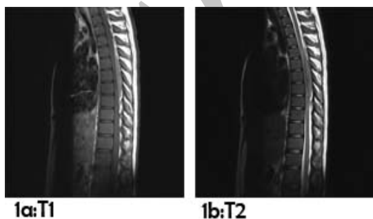
Figure 1. 1a:T1 sequence of thoracic MRI 1b:T2 sequence of thoracic MRI

After 6 months, she came back with acute onset of weakness in lower limbs, back pain, fever and urinary incontinence. Pinprick and light touch complete sensory loss was found beneath umbilicus. Thoracic MRI with contrast revealed a dorsal epidural mass extending smoothly from T8 to T12 (10 cm) with spinal cord compression (causing hyperintense signal in the adjacent cord parenchyma) (Figure 1a and 1b).