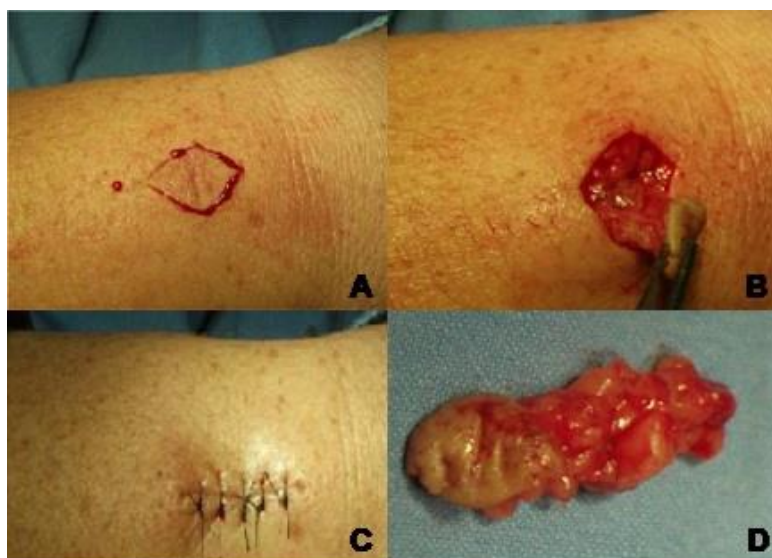
Figure 2. A to C: The main steps of the surgical procedure on the medial third of the right wrist, at the site of the previous biopsy; D: Gross feature of the excised subcutaneous glomus tumor