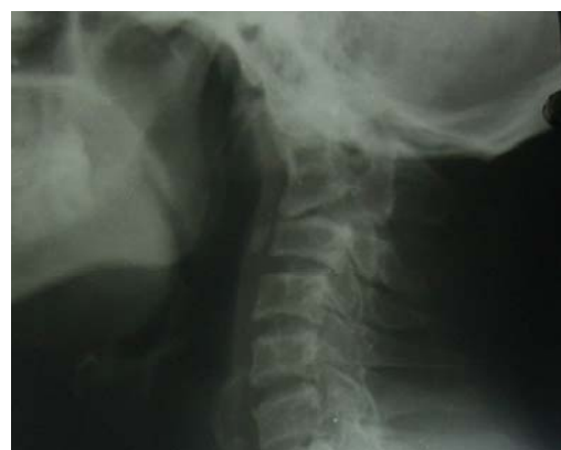
Figure 3: Plain X-ray of the cervical spine after a six-week follow-up showing spontaneous resorption of the graft