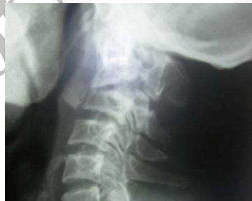
Figure 2: Plain X-ray of the cervical spine in the immediate postoperative period showing extrusion of the graft