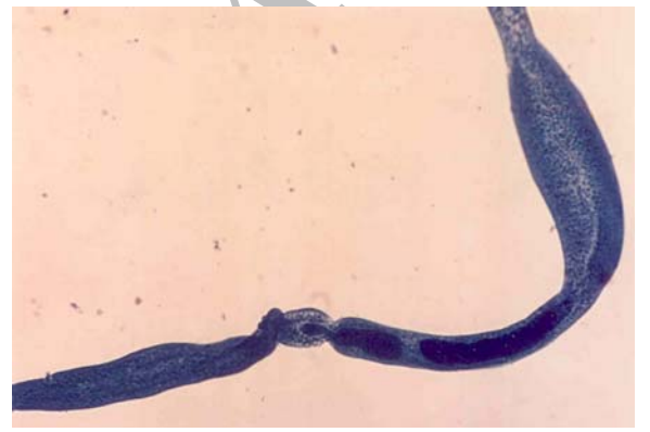
Figure 3. Adult male worm ( Trichobilharzia spp.) with gynecophoric canal (original magnification ×400).

Out of the 14,190 snails that were examined by both methods of cercariae shedding and crushing, 47 (0.33%) were infected with furcocercariae causing cercarial dermatitis, and 8 (0.056%) had