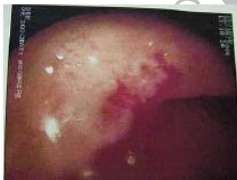
Figure 3. Double balloon enteroscopy.

A 54-year-old gentleman was referred to our gastrointestinal (GI) clinic. The chief complaint was a black tarry stool since two months prior to the admission. He was well up to two years ago, when he developed fatigue and weakness. He was managed with the impression of alpha-thalassemia during these two years. He had no abdominal pain, nausea and vomiting, weight loss, fever, constipation, or diarrhea during this period. He was a smoker and