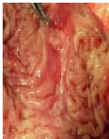
Figure 5. Ulcer in the base of ileal duplication cyst.