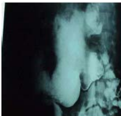
Figure 1. Small bowel series