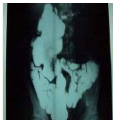
Figure 2. Small bowel series