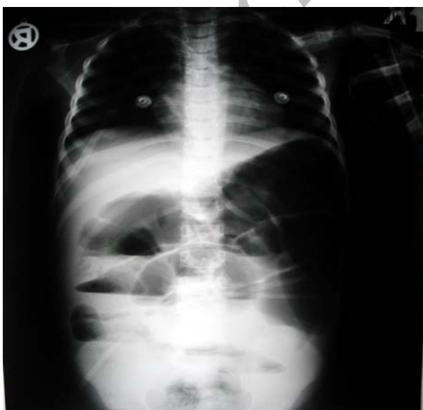
Figure 1. Plain abdominal X-ray of the patient.

Finally, we decided to perform laparotomy for