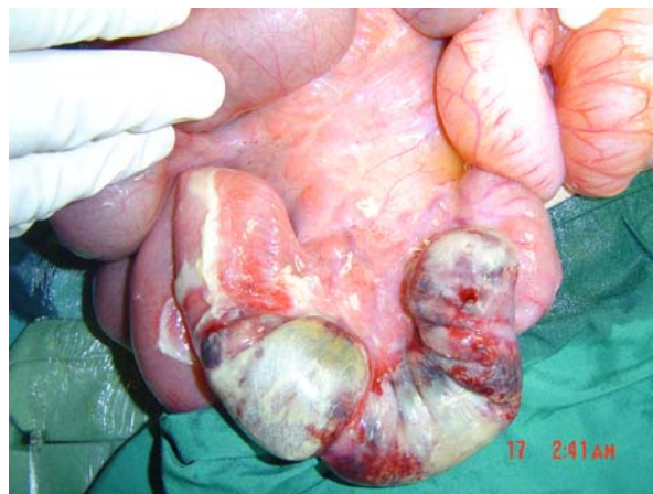
Figure 2. The necrotic bowel segment.

her acute abdomen. Just before operation, she had an arterial blood pH of 7.22, bicarbonate of 7.6 mmol/L; base deficit of -13 mEq/L, and a blood sugar of 290 mg/dL.