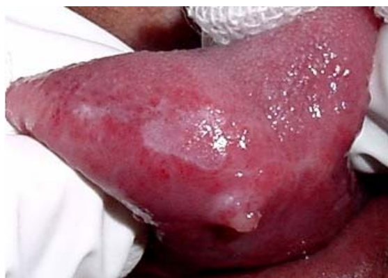
Figure 1. Pink- to red-colored exophytic lesion, 0.5 cm in the largest diameter, surrounded by a leukoplakic area and white striae, observed at the tip of the tongue.

After the second biopsy, the patient was referred to a genetic specialist and an oncologist