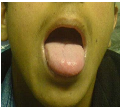
Figure 4. The patient's tongue after the last surgery.

the tongue but in our case, the tumor was at the tip of the tongue. There is no significant statistical difference in gender.