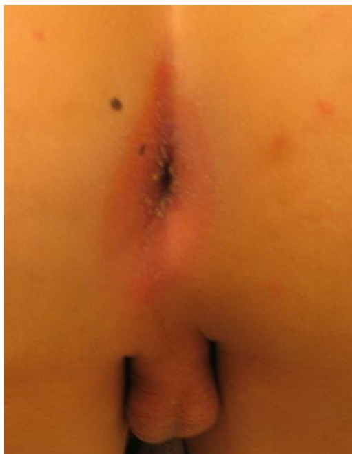
Figure 1. Perianal rash