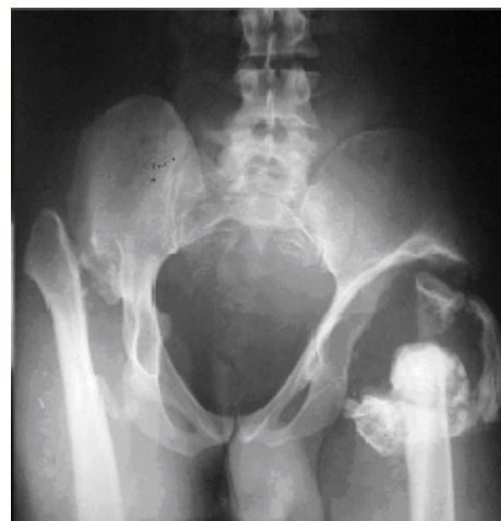
Figure 3. Joint destruction in hip

dorsal root ganglia and motor neurons, leading to distal sensory loss and later in the course of disease, distal muscle wasting, weakness and variable degrees of neural deafness. 5,6 Most cases of HSAN type 1 show an autosomal dominant mode of inheritance.