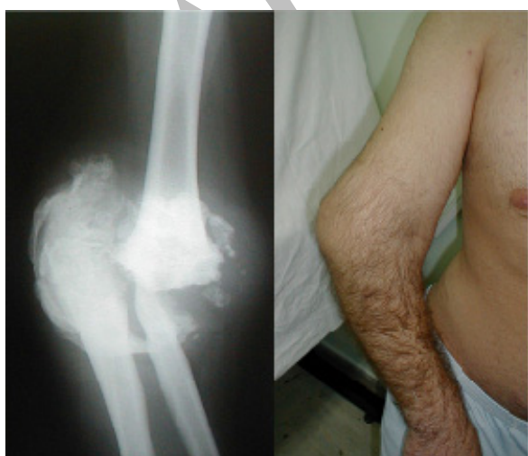
Figure 2. Deformity in elbow

Orthopedic consequences (osteomyelitis, Charcot arthropathy, dislocations, and fractures) often lead to the diagnosis and have important prognostic implications. 4 HSAN type 1 is characterized by progressive degeneration of