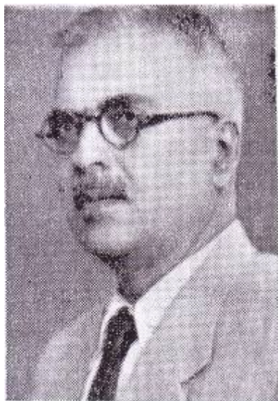
Figure 1. Dr. Mohammad Hessabi (1899 – 1990), the first specialty trained radiologist in Iran.

the sparks firing between the manually-wound coils spanned dozens of inches and created such a loud noise that not many people from the hospital dared to enter the eerie workshop.