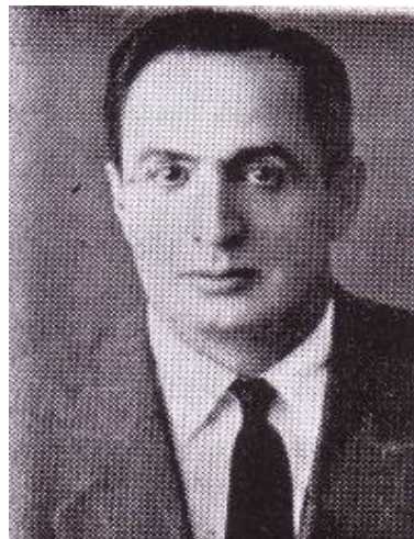
Figure 6. Dr. Abolghassem Bahrami laid the foundations of modern radiology in Isfahan.

the capital city of Tehran. Dr. Manuchehrian has compiled a two-volume treatise on medical physics in Persian (Figure 4).