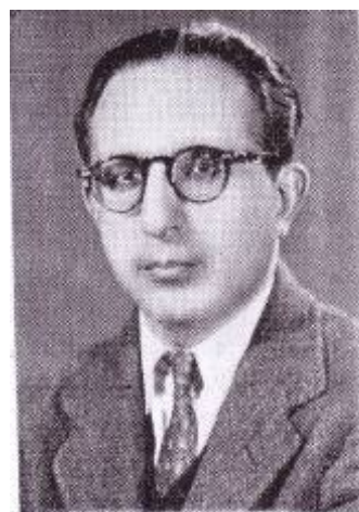
Figure 3. Dr. Ahmad Farhad (1901 – 1981)

The importance of radiology physics as an indispensable adjunct to the science of radiology was