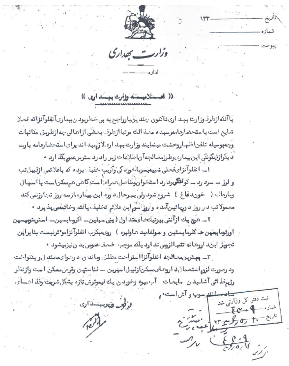
Figure 2: The declaration of the Ministry of Health on the influenza outbreak in 1957 focused mainly on bed rest, high fluid intake, and short duration of the disease.

Around 32 years after the 1918 Spanish flu, another influenza epidemic occurred in Iran in 1957, however, was not as severe. Figure 2 shows the declaration of the Ministry of Health on this influenza outbreak with a number of recommendations to patients, including more fluid intake, bed rest and no antibiotic usage.