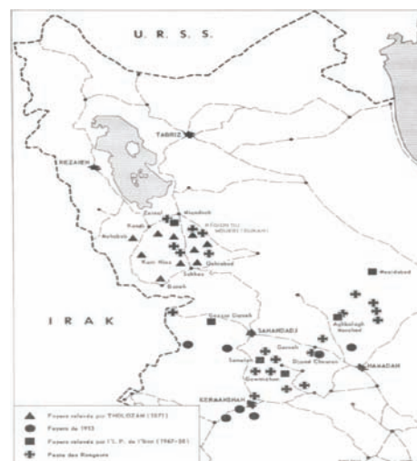
Figure 3. A map showing the natural plague foci in northwestern Iran, including Azarbaijan, Kurdistan, Kermanshah, and Hamadan provinces based on four different studies 22