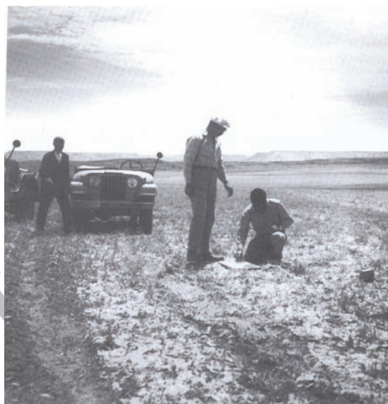
Figure 2. The investigative team of the Pasteur Institute of Iran evaluating plague bacilli infected reservoirs among the rodents in Kurdistan Province, Iran 22