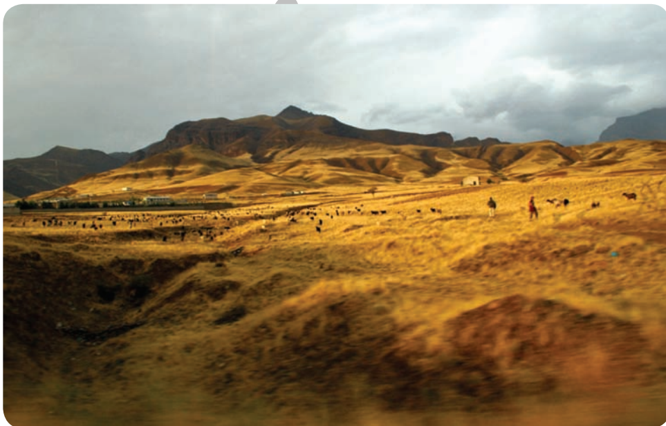
Alamut, around 100 km from present-day Tehran - Qazvin Province -Iran