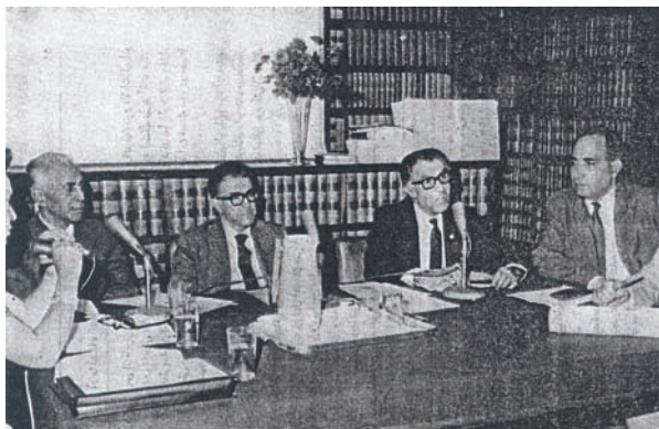
Figure 6. A picture of the International Seminar of the Human Plague, Pasteur Institute of Iran, 1970.

The Bacteriology Department of the Pasteur Institute of Iran was established in 1953 23 and was a pioneer in research on epidemic diseases, including the human plague. An international plague seminar was held at the Pasteur Institute of Iran in 1970 (Figure 6). 20