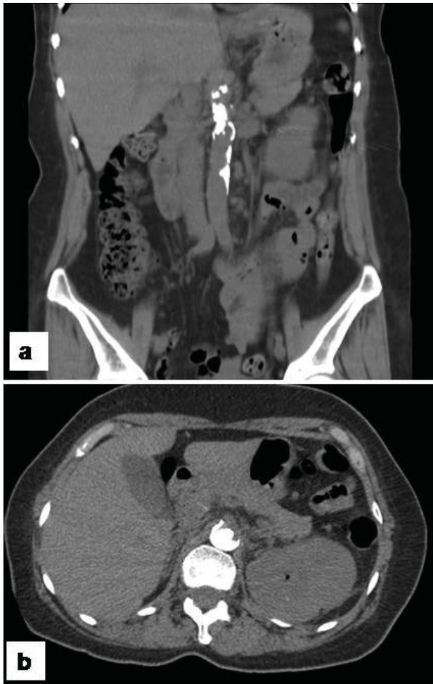
Figure 1. a) Coronal section of unenhanced computed tomography (CT) revealed a heavily calcified aortic lesion extending from the level of the superior mesenteric artery to the infra-renal artery. b) Axial section showed an incomplete occlusion of the aortic lumen.