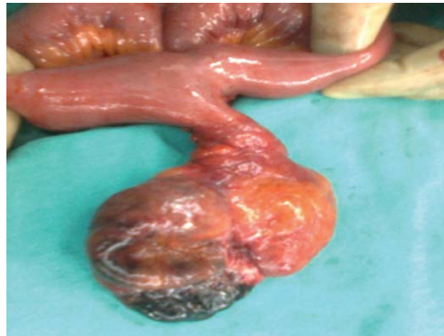
Figure 2. A 25 mm nodule was found at the apex of Meckel's diverticulum.