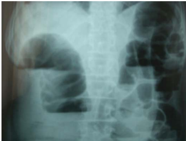
Figure 1. Plain abdominal X-rays were first obtained in patient with acute symptoms, which revealed air-fluid levels suggestive of intestinal obstruction.