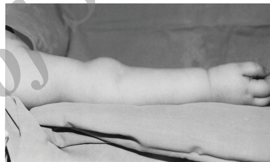
Figure 1. Photo of the pseudoaneurysm.

Tel: +3851 46 00 227, Fax: +385 1 46 00 169, E-mail: mirko.ganjer@gmail.com Accepted for publication: 4 April 2012