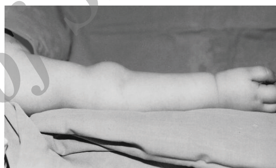
Figure 1. Photo of the pseudoaneurysm.

Tel: +3851 46 00 227, Fax: +385 1 46 00 169, E-mail: mirko.ganjer@gmail.com Accepted for publication: 4 April 2012