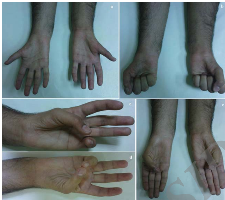
Figure 1. a) Atrophy in both thumbs and bilateral flattening of the thenar eminences, b) Atrophy in both thumbs and bilateral flattening of the thenar eminences c) Opposition deficit in the left hand, d) Opposition in the right hand, e) Abduction deficit in both thumbs.