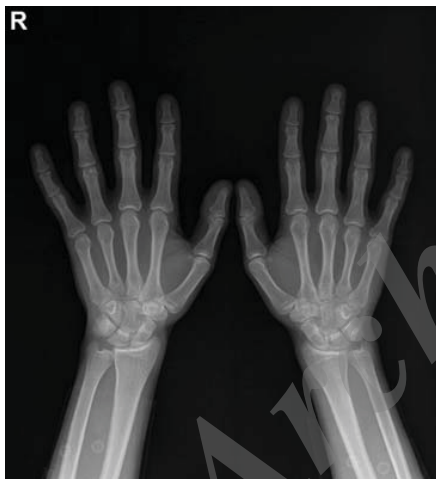
Figure 2. X-ray (AP) graphics of both of the wrists.