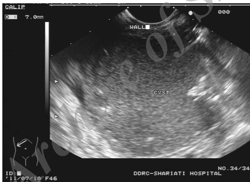
Figure 1. EUS appearance in a patient with a large pseudocyst in the pancreatic head. The cyst contains debris. The cyst was drained through EUS-guided cyst-duodenostomy.

ally have a thin and uniform wall. 41 On EUS, some pseudocysts are uniformly anechoic and some others contain large amounts of debris (Figure 1). Cyst fluid is yellow to brown. Infected pseudocysts may contain gross pus. Cyst fluid contains low CEA and high amylase levels. Pancreatic pseudocyst in an asymptomatic patient can be managed expectantly; however, a large pseudocyst in a symptomatic patient requires intervention. The intervention includes drainage rather than resection. Drainage of pancreatic pseudocyst can be carried out through endoscopic, radiologic, or surgical approach. 42 EUS-guided drainage is emerging as a safe and effective way to treat pancreatic pseudocysts. 43,44