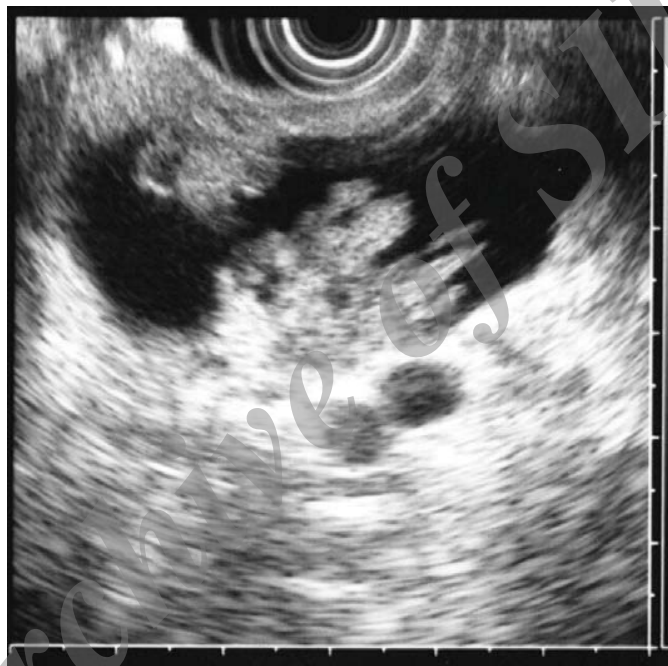
Figure 3. EUS features of main duct intraductal papillary mucinous neoplasm (IPMN) of the pancreas. Note the ectatic dilation of the main pancreatic duct which harbors multiple mural nodules.