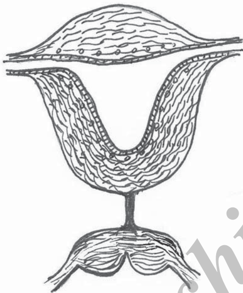
Figure 3. Schematic diagram of the anatomical abnormality.

An ultrasound scan performed during the second admission was remarkable for a large cystic structure ( 19 \times 13.5 \times 8 cm) filled with echogenic material. Other cystic structures ( 2 \times 4 cm) were reported in both adnexa. Laboratory analyses had the following results: estrogen = 89, TSH = 1.5, FSH = 4.3, LH = 2.5, prolactin = 14.4, testosterone = 0.4, dehydroepiandrosterone sulfate (DHEAS) = 1, WBC = 7.6 \times 10^3/\text{UL} , RBC = 3.98 \times 10^6/\text{UL} , Hb = 10.2 g/dL, platelet = 422 \times 10^3/\text{UL} , INR = 1.09 mg/dL, FBS = 95 mg/dL, BUN = 16 mg/dL, creatinine = 0.5, and normal urinalysis.