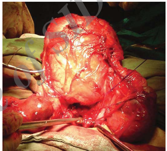
Figure 4. Anastomosis of the uterus to the cervical stump by creation of a canal covered with a peritoneal graft.

A transverse incision on the lower part of the uterus was created and approximately 700 cc of old blood was drained. The ureters were catheterized to prevent any damage. The peritoneum of the post cul-de-sac on the blind cervical tissue was opened. Cervical tissue was opened and a Hegar dilator was placed inside to act as a guide for