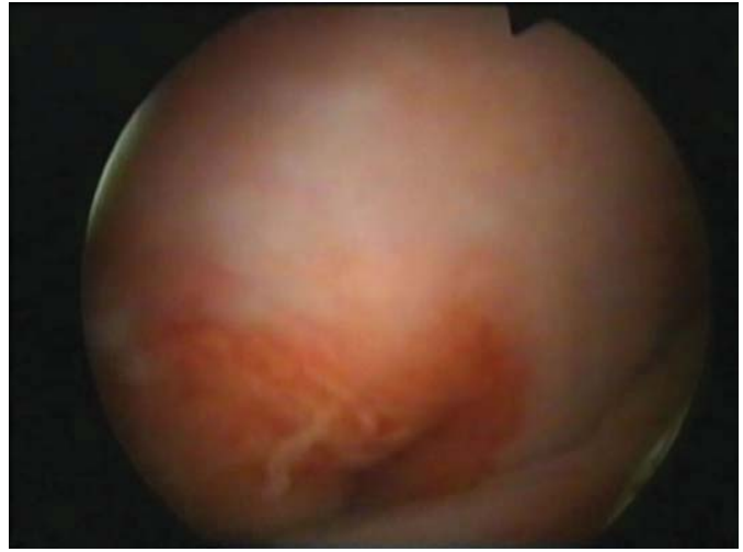
Figure 2. Vaginoscopy showed a normal appearing cervix.