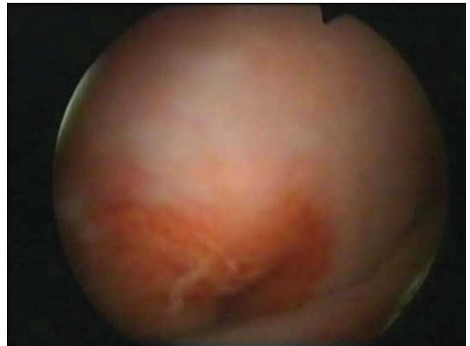
Figure 2. Vaginotomy showed a normal appearing cervix.