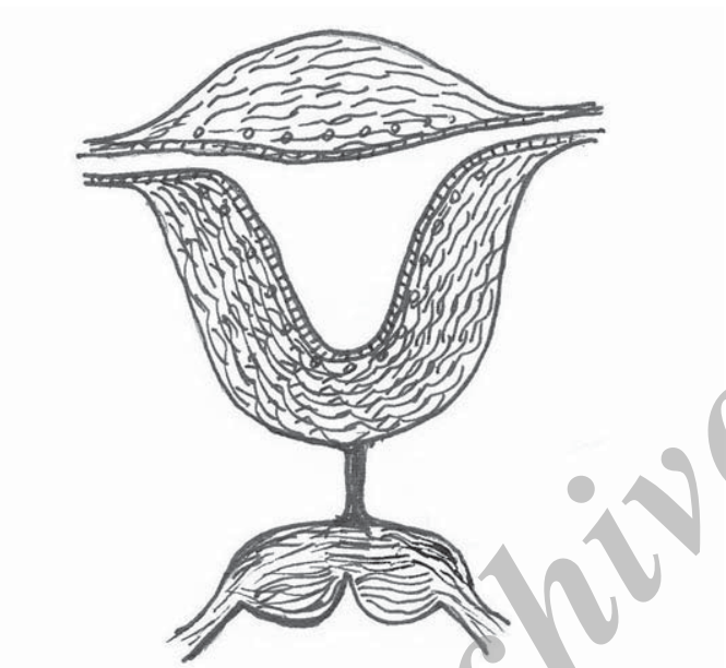
Figure 3. Schematic diagram of the anatomical abnormality.

An ultrasound scan performed during the second admission was remarkable for a large cystic structure (19 × 13.5 × 8 cm) filled with echogenic material. Other cystic structures (2 × 4 cm) were reported in both adnexa. Laboratory analyses had the following results: estrogen = 89, TSH = 1.5, FSH = 4.3, LH = 2.5, prolactin = 14.4, testosterone = 0.4, dehydroepiandrosterone sulfate (DHEAS) = 1, WBC = 7.6 × 10 3 /UL, RBC = 3.98 × 10 6 /UL, Hb = 10.2 g/dL, platelet = 422 × 10 3 /UL, INR = 1.09 mg/dL, FBS = 95 mg/dL, BUN = 16 mg/dL, creatinine = 0.5, and normal urinalysis.