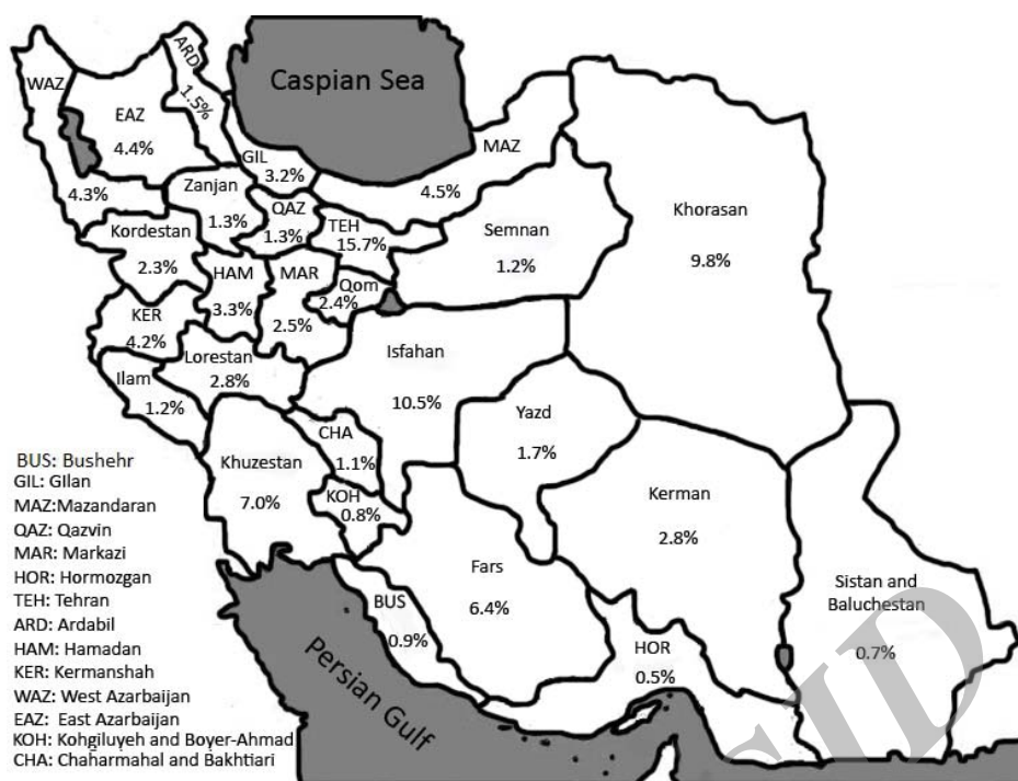
Figure 3. Relative frequency of Iranian martyrs of Iraq-Iran war based on different provinces.

complained of mental disorders. 51 Nourbala and colleagues studied the mental complications of Iranian prisoners of war. They showed that 48.3 % of them had adjustment disorders, 22 % had mood disorders, and 9.9 % had anxiety disorders in their first six months of freedom. The most common psychiatric disorder was post-traumatic stress disorder (PTSD). 52