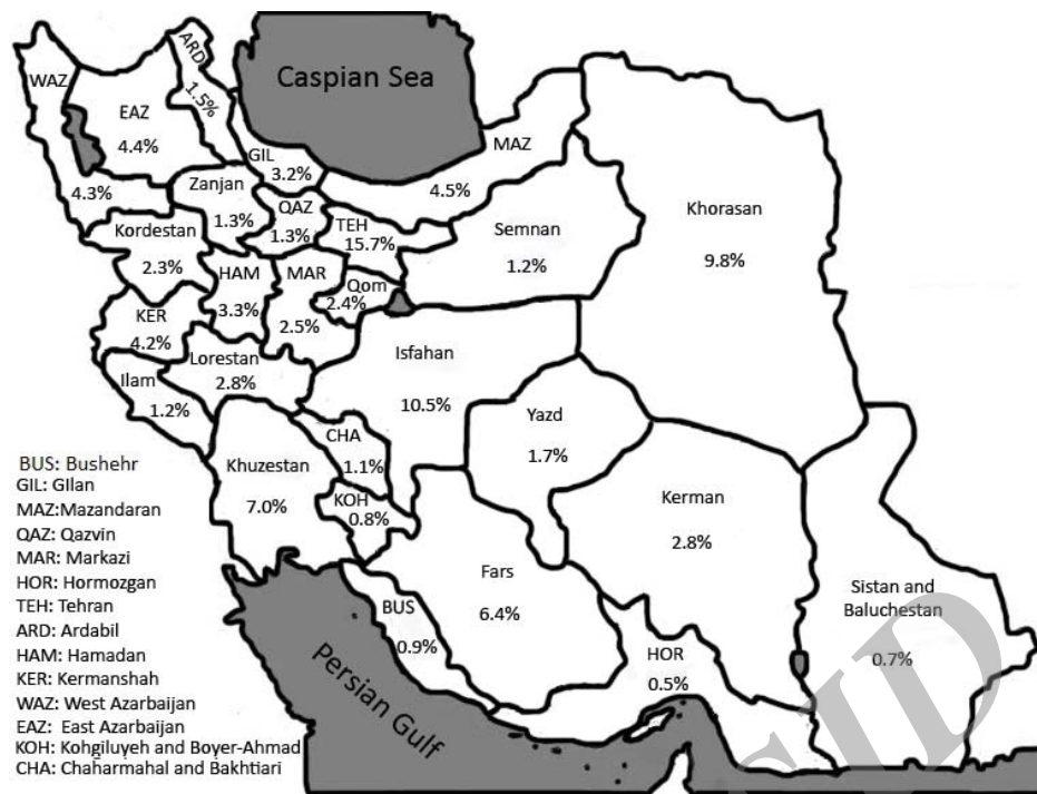
Figure 3. Relative frequency of Iranian martyrs of Iraq-Iran war based on different provinces.

complained of mental disorders. 51 Nourbala and colleagues studied the mental complications of Iranian prisoners of war. They showed that 48.3 % of them had adjustment disorders, 22 % had mood disorders, and 9.9 % had anxiety disorders in their first six months of freedom. The most common psychiatric disorder was post-traumatic stress disorder (PTSD). 52