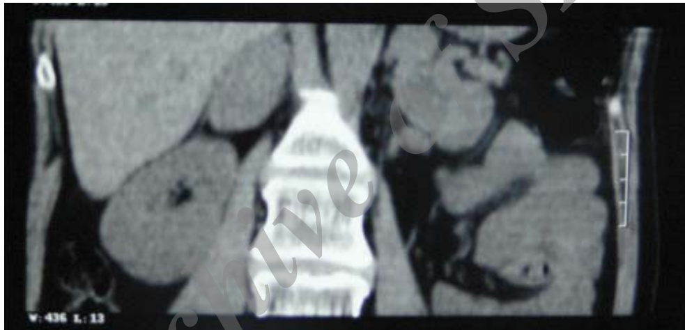
Figure 1. Adrenal CT imaging of the patient