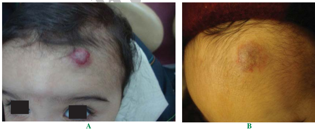
Figure 2. (A) A 9-month-old girl with an IH lesion on her forehead before the treatment. (B) The same patient after 16 weeks of combined PDL and topical propranolol therapy.

Medical Sciences was obtained and all Parents provided informed Consent. Before study set up we registered it in Iranian Registry of Clinical Trials, available at: URL: http://www.irct.ir/ (Identifier: IRCT 201110137787N1).