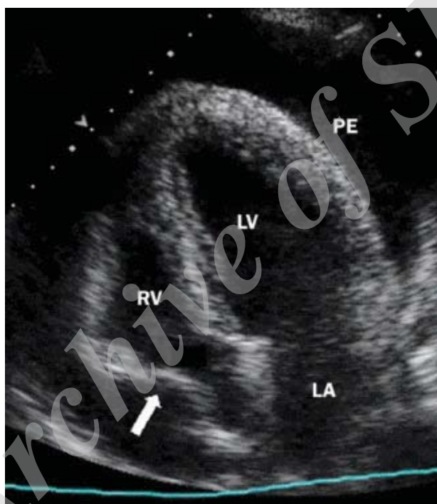
Figure 2. Trans-thoracic echocardiography showed significant pericardial effusion.

contained numerous lymphocytes, inflation, but no granulomatous cells. It was nonspecific suggesting of the inflammatory process and cGVHD. All microbiological studies (PCR for detection of CMV, herpes simplex I and II, human herpes 6, Epstein-Barr and varicella-zoster; bacterial, mycobacterial and fungal microscopy and culture) were negative. After two days, trans-thoracic echocardiography showed a significant increase of the pericardial effusion. The patient was impending to cardiac tamponade requiring pericardectomy. Pericardectomy resulted in significant improvement in ventricular filling. The pericardial drainage tube was withdrawn after 5 days, and the patient was discharged from hospital on day 15. Treatment with prednisolone, MM and CYA was continued. Skin GVHD didn't improve with resolution of pericardial effusion. The patient had no cardiac problems after that.