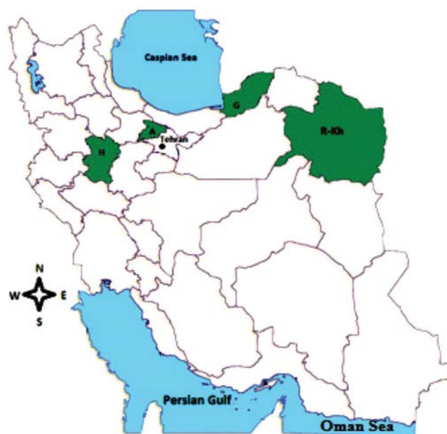
Figure 1. Map of Iran showing the geographic distribution of Iranian propolis studied samples. A: Alborz Province (Taleghan), H: Hamedan Province (Morad Beyg), G: Golestan Province (Kalaleh), R-Kh: Razavi Khorasan Province (Chenaran).

To remove the unwanted materials and preserve the active components, we used different extraction methods. In general, 30 g of the frozen propolis was chopped into small pieces and grounded into fine powder using a mortar and pestle. The powdered samples were stored in appropriate containers and kept at 4°C. For extraction, the unwanted bee wax was first removed by mixing 30 g crude propolis extract with 100 mL of n-hexane at a ratio of 3:10 (w/v) (Merck, MA, USA). After 4-day shaking (120 rpm) at 30°C, the hexane solvent was filtered with Whatman 42 filter paper (Sigma-Aldrich Co., St. Louis, MO, USA), and green propolis samples were dried at room temperature. After removing