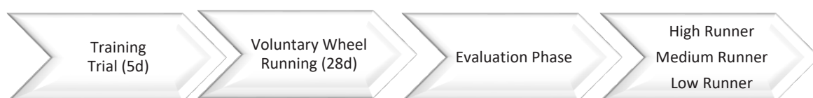
Figure 1. The Entire Phases of Experiment Procedure.

Table 1 and Figure 2 demonstrate the upward trend of mean running scores in experimental groups. Data presented in the table shows that the total mean score of running was 2233.11 in the first week, 2677.76 in the second week, 2940.96 in the third week, and 5105.70 in the last week. Also, the running mean scores obtained