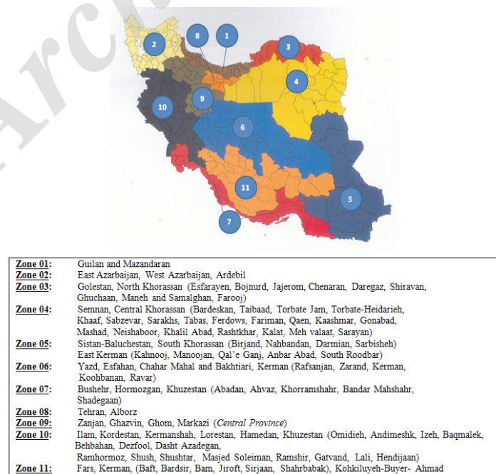
Figure 1. The Study Zones.

The final sample size, considering the design effect (1.3), the need to have disaggregated information for each zone by MOHME, and the likelihood of missing some units, was determined to be 397 (for practical purposes, n = 400 ) for each statistical group in each study zone. The cluster size chosen was 5, so each cluster included 5 children aged 15–23 months, 5 children aged 6 years, 5 girls aged 14–20 years, 5 boys aged 15–20 years, 5 pregnant women past their fifth month of gestation, 5 women aged 50–60 years, and 5 men aged 45–60 years. Consequently, 80 five-subject clusters of each of the 7 statistical groups in each of the 11 study zones were included in the study; that is, n = 2800 in each of the 11 zones. Thus, a total of 30 800 individuals were included in the study. In order to ensure that a sufficient number (5) of subjects was selected in each age/sex group, 7 rather than 5 subjects were identified and invited for the interview, considering that some identified subjects may not be present at the right time. So, the total number of