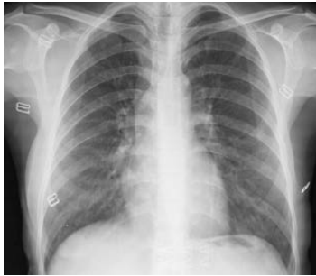
Figure 2. Interstitial Infiltrates in Both Lungs.