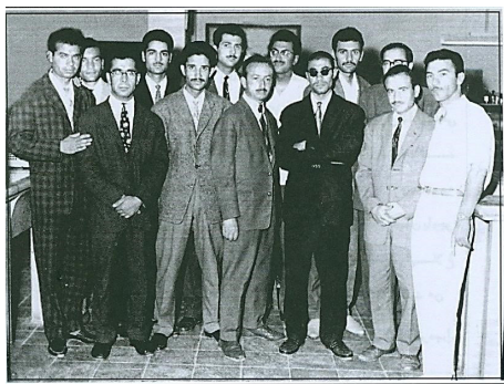
Figure 3. The first group of students who enrolled in the Isfahan University Pharmacy School in 1956. 1

establishment of Isfahan University and its faculty of pharmacy (chapter 5), the history of students' admission at the higher scientific educational centers in Iran between 1956 and 1980 (chapter 6). The first group of students enrolled at the Isfahan Pharmacy School in 1956 (Figure 3). 1