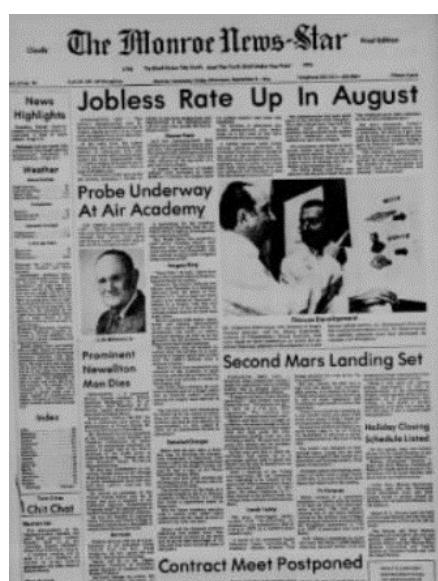
Figure 7. Repercussion of Dr. Bahmanyar's Activities in the American Newspaper "The Monroe News-Star" in 1975. 25

In 1956, Dr. Bahmanyar became the head of the