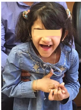
Figure 1. The Facial Features and Curved Fingers of the Patient.

The whole genome oligo Array CGH (Agilent, Santa Clara, CA) was performed using CYTOCHIP ISCA 8X60K version2 (Kariminejad-Najmabadi Pathology and Genetics Center, Iran) and analyzed using Blue Fuse Multi software per manufacturer's protocol. Cytogenetic analysis of the patient revealed 46, XX, der(10)t(4;10)(p12;q26.3) (Figure 2A). G-banding analysis of the mother showed 46 chromosomes with a balanced translocation between the short arm of chromosome 4 and the long arm of chromosome 10. Moreover, her karyotype was 46, XX, t(4;10)(p12;q26.3) (Figure 2B). The father's karyotype was normal. The array CGH results showed that the patient had the following genomic imbalances: (GRCh37) arr4p16.3p12 (37,152-45,490,207) x3, 10q26.3 (134,872,562-135,434,149) x 1. A 4.5 Mb genomic gain at 4p16.3p12 (Figure 2C) and 561.6 Kb terminal deletion at 10q26.3 compatible with trisomy 4p16.3p12 and 561.6 Kb loss of 10q26.3 compatible with monosomy of 10q26.3 were detected.